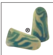
Camo Plugs ®