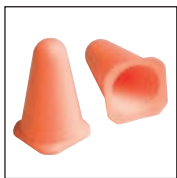
Traffic Cones ™